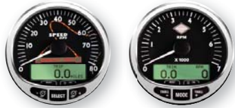
SC1000 Tach & Speed